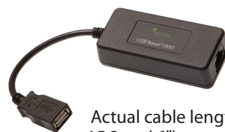
REX (Remote Extender)