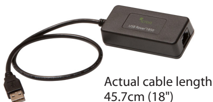
LEX (Local Extender)

www.icron.com sales@icron.com +1 604 638 3920