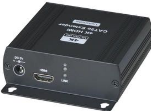
Back panel Transmitter unit