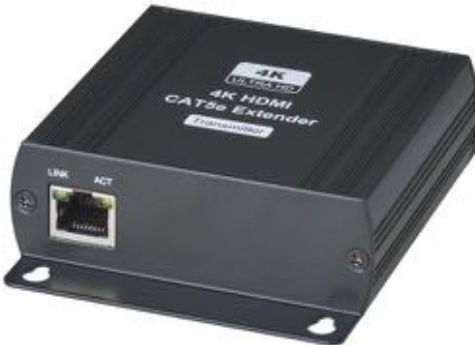
Front Panel Transmitter unit