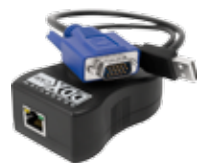
DDX-CAM-VGA VGA Computer Access Module (CAM) for the AdderView DDX

To find out more, visit: http://www.adder.com