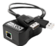
DDX-CAM-DP DisplayPort Computer Access Module (CAM) for the AdderView DDX