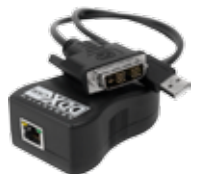
DDX-CAM-DVI DVI Computer Access Module (CAM) for the AdderView DDX