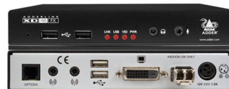
XD150FX RX - Front & Rear