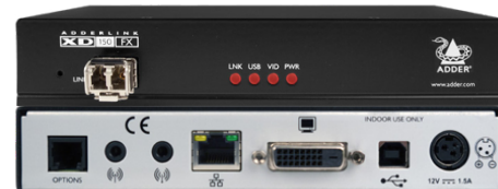
XD150FX TX - Front & Rear