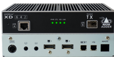
ADDERLink XD642 TX - Front & Rear