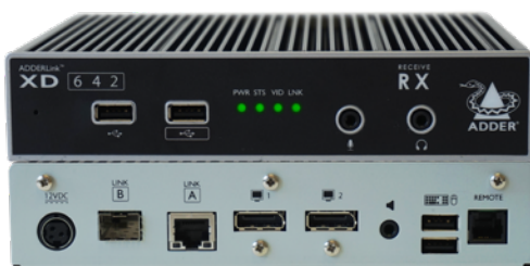
ADDERLink XD642 RX - Front & Rear

CAT6 is recommended for CATx extensions. CATx extensions are limited to 2 short patch connections. Patch cables should be CAT6 or better.