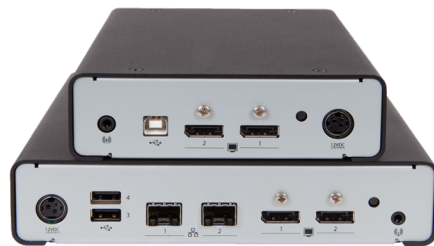
ADDERLink INFINITY 2122 TX & RX - Rear