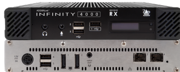
ALIF4001 RX - Front & Rear