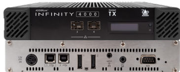
ALIF4001 TX - Front & Rear