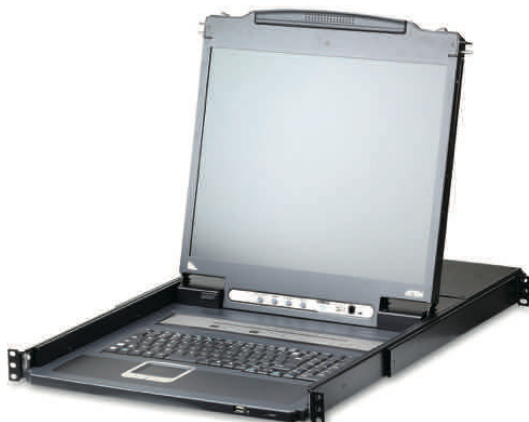
CL5716I Front View