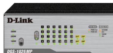
PoE usage LEDs

The DGS-1026MP features 24 10/100/1000BASE-T ports that support the IEEE 802.3at+ PoE standard. Each of the 24 PoE ports can supply up to 30 W, with a total PoE budget of 370 W, allowing users to attach multiple IEEE 802.3at-compliant devices to the DGS-1026MP without requiring additional power sources. Power over Ethernet is especially suitable for powering devices that are too far away from power outlets or for minimising the clutter of extra cables. The PoE usage LEDs further provide real-time feedback on the current PoE power usage on the network and helps plan out the PoE network budget, preventing PoE overloading problems.