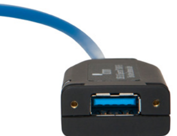
Locking USB Receptacle