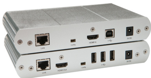
Rear view of LEX (top) and REX (bottom)