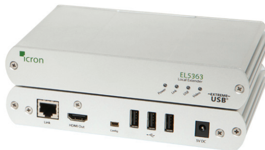
LEX (Local Extender) front view

The EL5363 KVM Extender System features the latest and most robust HD video and USB extension technology from Icron Technologies. The EL5363 extends both HDMI and USB 2.0 up to 100m using a single Cat 5e/6/7 cable.