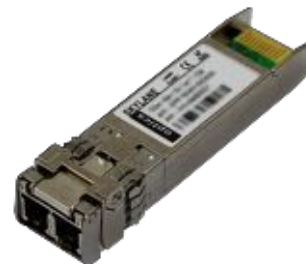
Figure 1. SFP+ Dual Fibre (non-binding illustration)